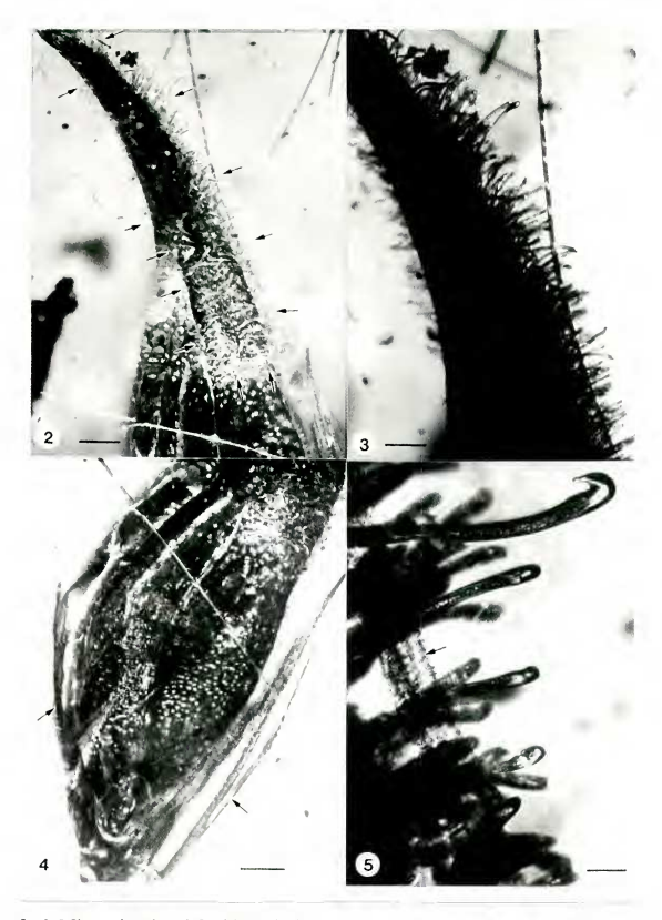
Fics. 2 – 5. Pharus primuncinatus in Dominican amber (elongate strands in all photos are segments of mammalian hair). 2. Tip of lemma showing bearded portion (delineated with arrows) covered with uncinate macrohairs. Bar = 36 µm. 3. Upper portion of lemma showing range in size of uncinate macrohairs. Bar = 278 µm. 4. Lower portion of lemma and two glumes (arrows). Note papillose surface of lemma. Bar = 450 µm. 5. Detail of uncinate macrohairs. Note one strand of mammalian hair (arrow) enclosed by the plant macrohairs. Bar = 56 µm.